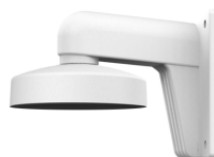
Wall mount DS-1272ZJ-110