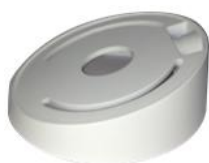
Inclined ceiling mount DS-1259ZJ