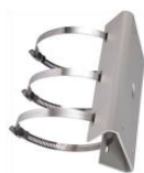
DS-1275ZJ Vertical pole mount