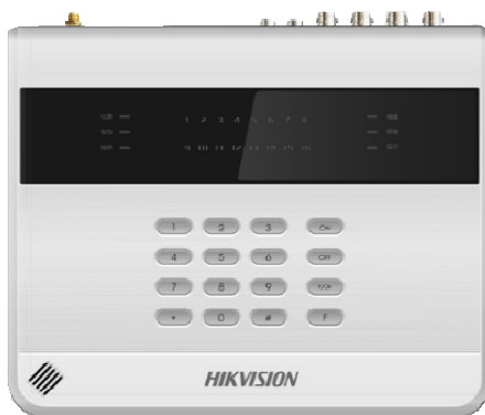
DS-19S08-04F/K1 or DS-19S08-04F/K1Gx

It is mainly applied to the security systems of shoppingmall, stores, residence, apartments, communities, etc. It can be used cooperatively with the video surveillance and access control subsystem through the software operation.